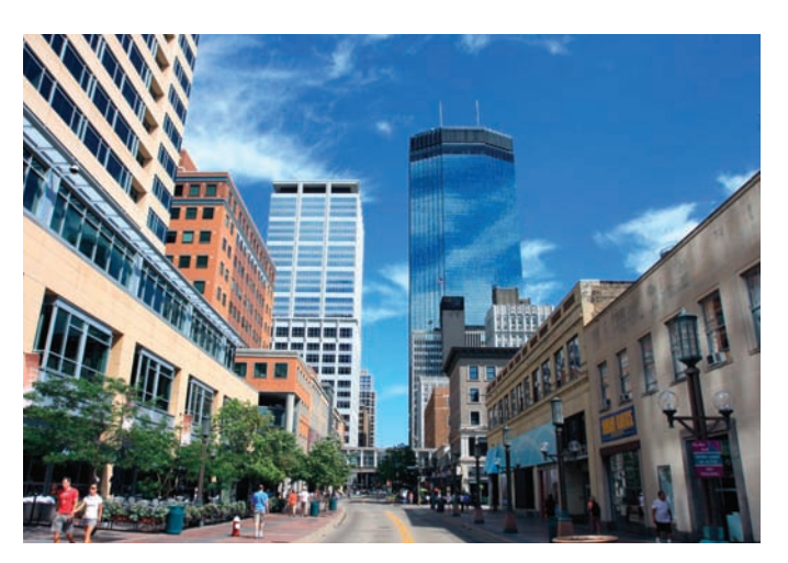
NICOLLET MALL