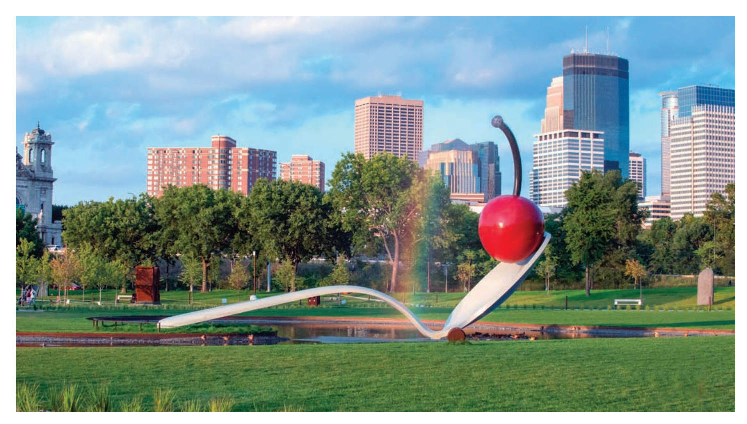
MINNEAPOLIS SCULPTURE GARDEN