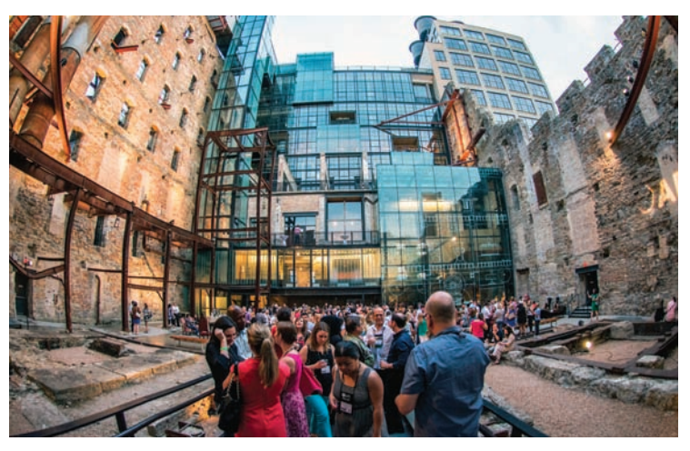
MILL CITY MUSEUM • MEET MINNEAPOLIS