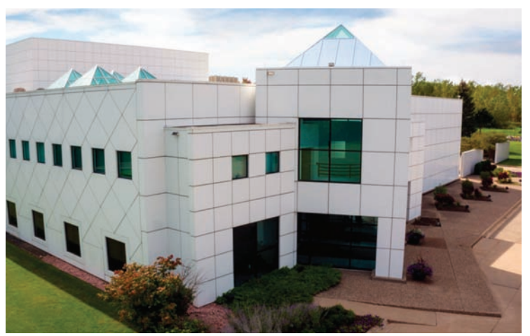
PAISLEY PARK