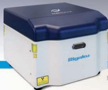
NEX CG II