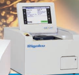
NEX QC Series

Rigaku EDXRF analyzers deliver rapid multi-elemental analysis and reduce standards requirements.