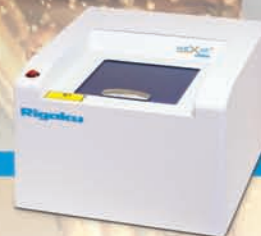
NEX QC+ QuantEZ